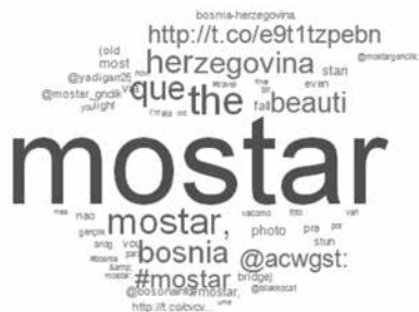
Figure 3 Word cloud analyses opinions on Mostar as a destination

>colWC <- brewer.pal(8,"Dark2") >wordcloud(m.d$word,m. d$freq,scale=c(8,,2),min.freq=4,max.words=Inf, random.order= FALSE,rot.per=.15,colors=colWC)