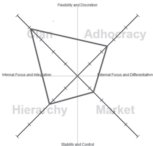
Figure 2. Surveyed students' preferences of the future employer's organizational culture

This means that they aspire to work in a company whose success is primarily the result of employee loyalty, tradition and mutual cooperation of all employees. Interpersonal relationships in companies with the clan organizational culture are based on caring for people (Cameron, 2004; www.ocai-online.com). Because of this, members of the clan culture tolerate the stresses of everyday business more easily, even the low salaries. In the clan culture, employees respect each other: workers see their managers more as mentors and management tends to take into account the opinion of all employees when making business decisions. In such companies, there is an overall atmosphere of mutual respect and support, which is actually the main source of job commitment of employees and their effectiveness. These results are presented in Figure 2 and Table 3.