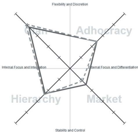
Figure 3. Diagram of differences in organizational culture preferences depending on the gender of the respondents