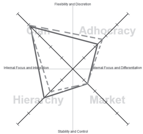
Figure 4. Diagram of differences in organizational culture preferences depending on the desired place of employment

Figure 4 shows the differences and similarities between students who want to work in Croatia (solid line) after their graduation or abroad (dashed line). This category of respondents once again repeats the clan culture domination. Therefore, a “by-product” of this analysis is much more interesting, because it reveals that actually more students want to leave their country and work abroad, rather than find employment in Croatia!