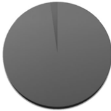
Chart 1 The relation of business commitments ratio and passive vacation ratio, as the motives of tourists' arrival to Istria