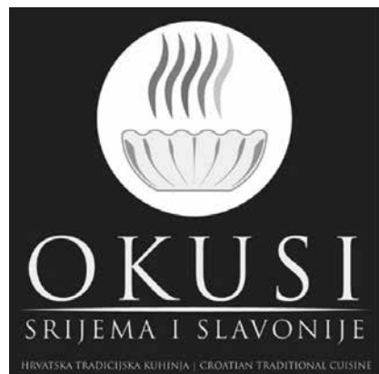
Figure 1 The symbol implemented for the regional local food of Eastern Croatia