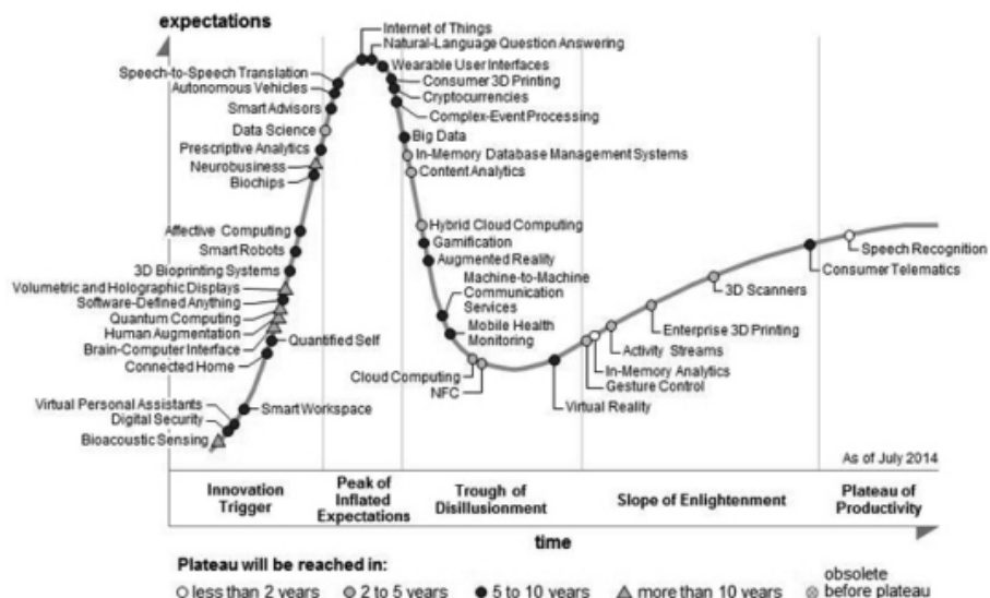
Figure 2 Gartner's Hype Cycle (2014)

Source: http://siliconangle.com/blog/2014/08/19/gartners-hype-cycle-big-datas-on-the-slippery-slope/ (Accessed on: November 17, 2015)