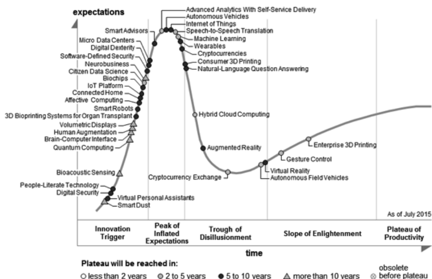
Figure 3 Gartner's Hype Cycle (2014)