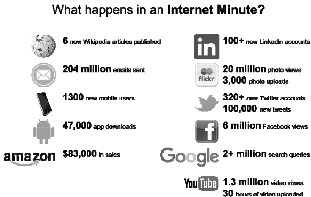
Figure 1 What happens in an Internet minute?