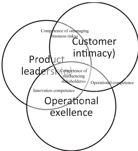
Figure 1 Types of competitive advantage and competences

Figure 1 graphically summarizes the interaction between distinctive ways of competing (product leadership, customer intimacy, and operational excellence) and different types of organizational competences.