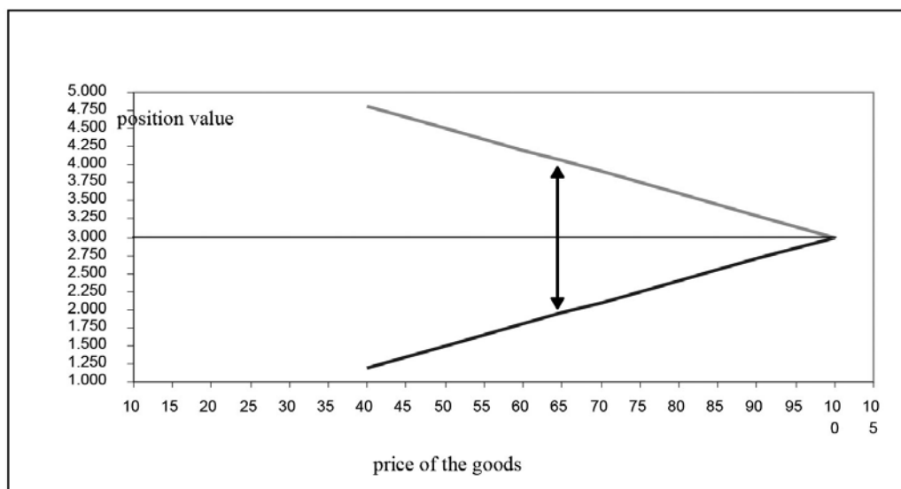
Figure 1 Simultaneous taking of opposite positions - offset